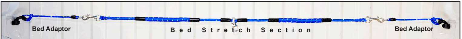
5. When installed the PUP will look like this.