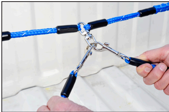
6. Clip the bungee stretch sections to the coupler swivel at the center of the cross member.