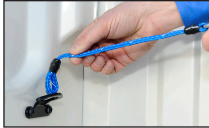
1. Insert the soft loop end of the PUP bed adaptor through the bed tiedown.

Two sets of Bed Adaptors are supplied. Use the appropriate length for the width of your truck bed.