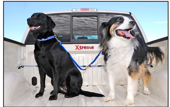
7. Clip the bungee stretch sections to your dogs collars and you're ready to roll.

Handle is included when you purchase one or more dog attachments with the Pick Up Pal