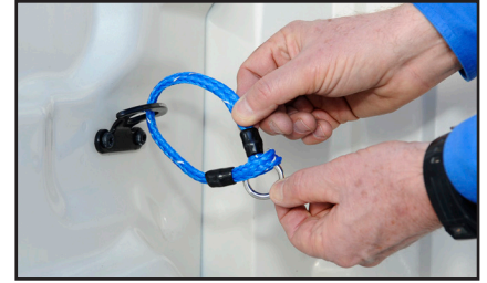
2. Thread the ring through the soft loop and tighten.